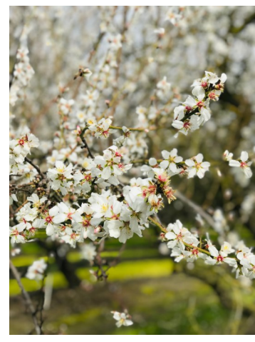
Happy St. Patrick's Day. See you in church!